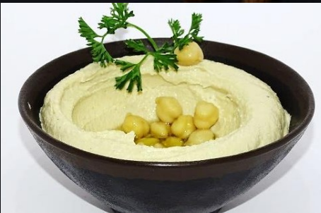
HUMMUS PLAIN $12/21.60 naf