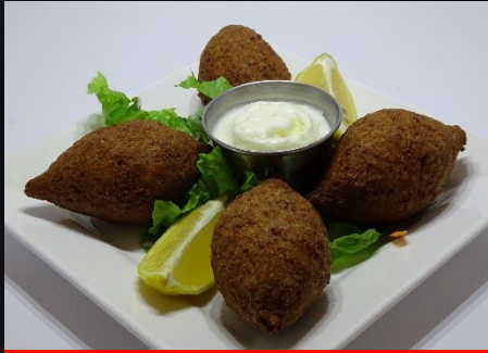
FRIED BEEF KIBBEH $ 15/27.00 naf