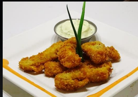
GROUPER FINGERS $ 17/30.50 naf