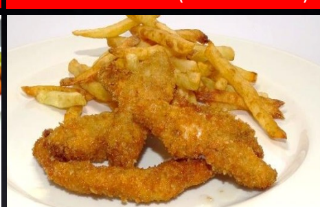
CHICKEN FINGER ADULT $ 18/32.40 naf