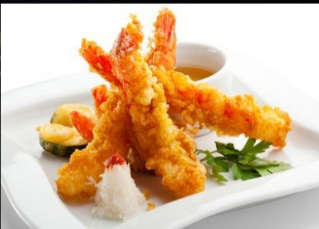
SHRIMP TEMPURA $ 17/30.50 naf