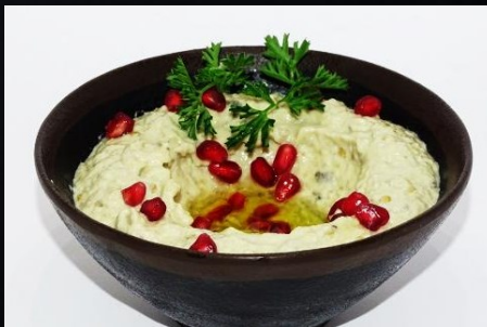
BABA GHANOUSH $ 12/21.60 naf