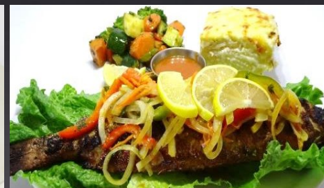
RED SNAPPER LARGE $ 32/57.60 naf