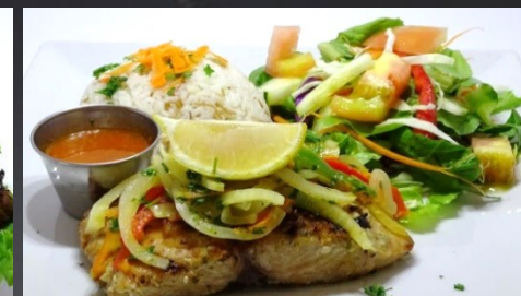
GRILLED MAHI-MAHI $ 25/45.00 naf

SERVICE CHARGE OF 15% WILL BE ADDED TO YOUR BILL