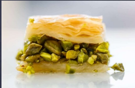
BAKLAVA ( 3 PCS)