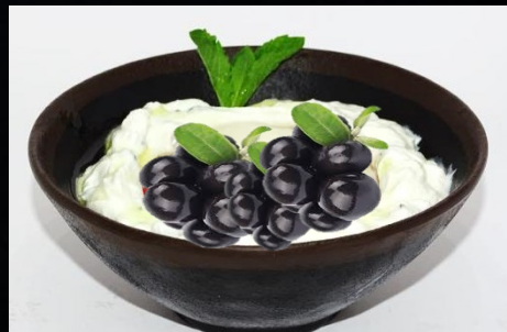
LABNEH $ 11/20.00 naf