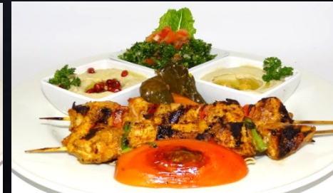
BEIRUT PLATE 3 STICK $ 29/52.20 naf