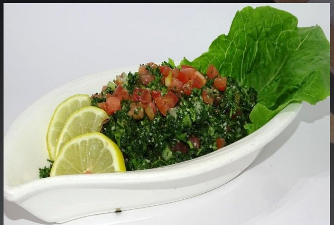
TABBOULEH (HOUSE FAVORITE)