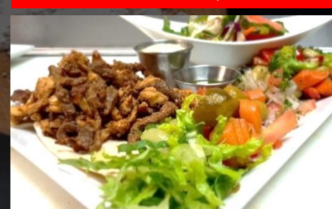
SHAWARMA PLATTER $ 22/39.60 naf