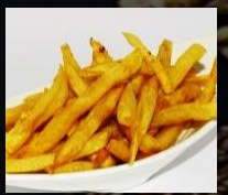
REGULAR OR SWEET