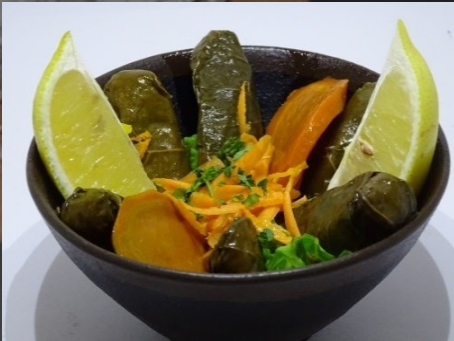
GRAPE LEAVES $ 12.00/21.60 naf