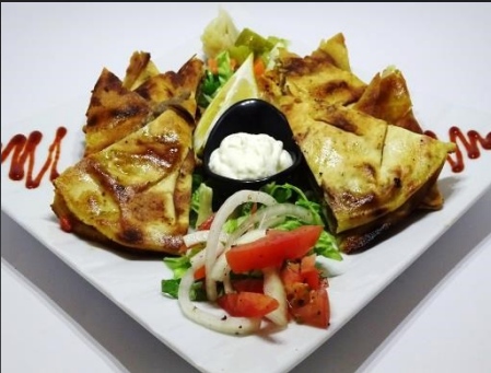
ARAYES $ 17/30.50 naf