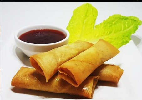
FISH-CHEESE-CHICKEN $ 12/21.6 naf