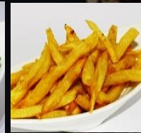
REGULAR OR SWEET