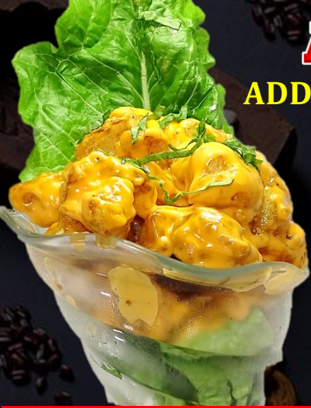
HURRICANE SHRIMP $ 18/32.350 naf