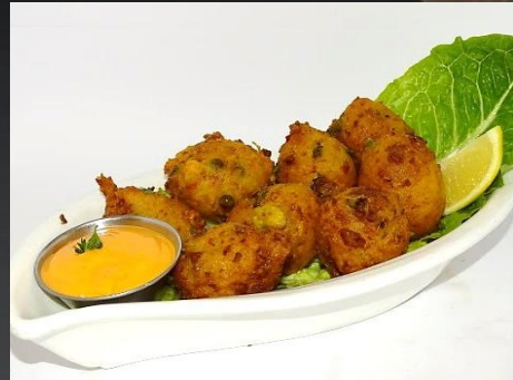
CONCH FRITTER $ 18/32.30 naf

SERVICE CHARGE OF 15 % WILL BE ADDED TO YOUR BILL