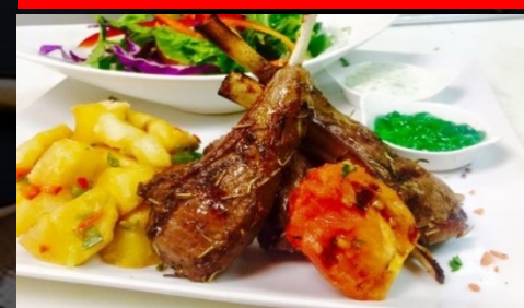
RACK OF LAMB