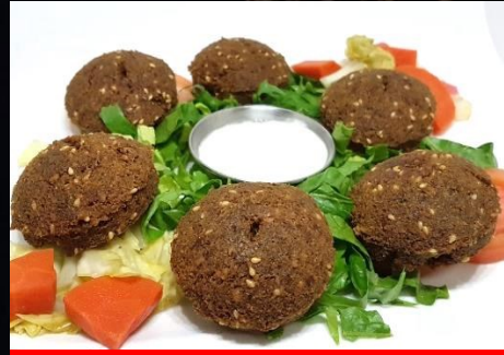
FALAFEL PLATE $ 12/21.60 naf